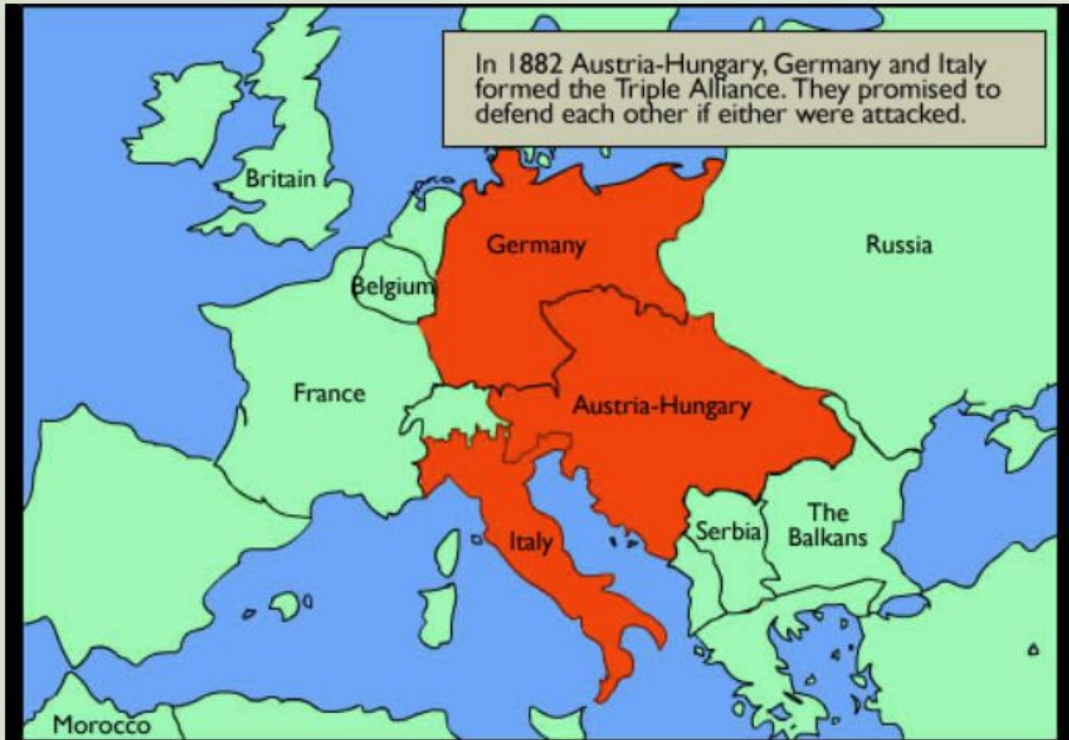
Map of Europe 1839-1914