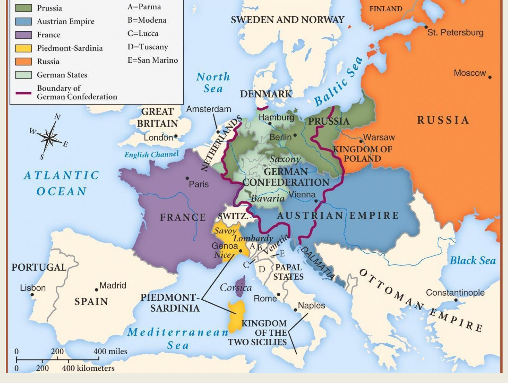
Europe in the 19<sup>th</sup> C